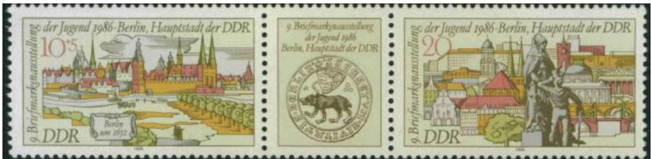
Scott #2554a. / Michel #W Zd 683* (Michel #3030, #3031 + label)

Although Black Prints are specialized items and are not often seen at dealer bourses, occasionally they can be found on eBay , although often not properly identified. Each of the East Germany Black Prints is identified in the Michel Deutschland-Spezial catalog, but they are not found in the Standard Scott catalog. The Black Print included in this newsletter is of the July 22, 1986, “9 th Youth Stamp Exhibition, Berlin” combination strip of a semipostal stamp + label + regular postage stamp, shown below with the corresponding Black Print.