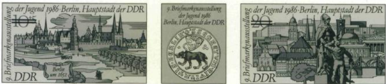
Michel #W Zd 683 S*

190,000 issued Sale Price: 3, M (@ $1.50) 2005 CV: 4, Euro (@ $6.00)