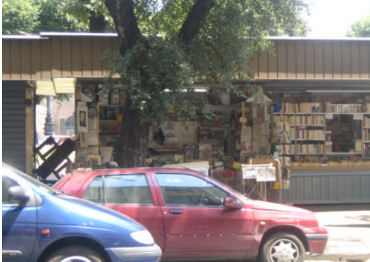
Street side stall in Rome