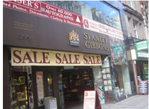
Stanley Gibbons store in London

While in England in June this year, I made a point to visit the Stanley Gibbons stamp store, one of the largest in the world. The shop is located just near Trafalgar Square in central London. Leaving my wife Jo in a street side café for her “cup of tea,” I stopped in for a visit. The store was about the size of an American chain drug store and was buzzing with activity. I counted 6 clerks on the main floor and 17 visitors at one time talking to clerks, browsing through albums, catalogs and packets, or at the back counter searching for specific countries or topics. The most amazing sight was a “proper English Lady” in her mid-fifties decked out in hat, gloves, dress, stockings, and high heels (in 90 degree temperatures during the European heat wave) sorting through country packets. Since I did not carry my UK want list, I only bought a few packets of European countries, just to say I’d shopped here.