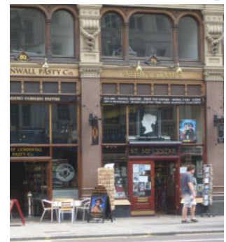
Stamp Centre of London