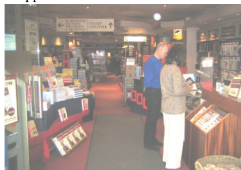
Inside the Gibbons store