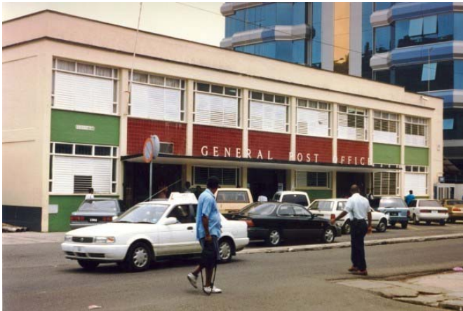
Figure 1. Castries, St. Lucia, General Post Office

General post offices (GPOs) are found in the capital city of each island. So for example the GPO on St. Lucia is in Castries (Figure 1). Most parish offices occupy single free standing buildings or are housed with other government agencies, particularly the police station. Village offices are found in a building used for postal services alone, or more often are found in someone's home (Figure 2).