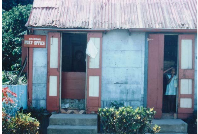
Figure 2. Calibishie, Dominica post office in a private home

I enjoy visiting the village post offices because the postal clerks are friendly and I can always learn much about local village and island life as well as interesting things about the postal service. Village post offices are not always easy to find, but as I was once told on St. Lucia when I suggested that a sign would help direct patrons to the post office that this was unnecessary since everyone already knew where the post office was. Because village post offices seldom carry a full range of stamp denominations, it is possible to create some very colorful postal usages. Sometimes local clerks are unfamiliar with particular rates, so they occasionally charge incorrect fees, also creating interesting usages. When visiting a post office, I try to have the clerk select and affix the stamps on my mail. I usually send local letters and cards back to my hotel, international air and registered cards and letters to myself, friends and relatives in the United States (I always make them give them back to me), and if I am traveling to another island, I also send cards and letters at regular and registered rates to myself at my future destination. In doing all this I have amassed a large number of postal items, each one of which has an interesting story behind it.