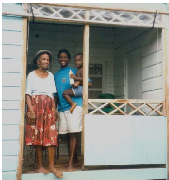
Figure 4. Bogius, St. Lucia post office.

(continued from page 3). Figure 4 shows the Bogius, St. Lucia postmistress (on the left), who held her position for over 30 years, making her the longest serving village postmistress on St. Lucia. This post office can only be