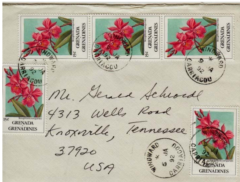
Figure 3. Airmail letter from Windward, Carriacou, rated 75 cents with 6 and 9 January cancels.

For example, shown in Figure 3 is a letter from the small village of Windward on Carriacou (part of the Grenadines) where five 15 cent stamps were used to pay the correct letter rate to the United States because no 75 cent stamps were available. The cover is canceled both 6 January and 9 January because as the clerk began to cancel the stamps on 6 January she noticed that she had inverted the six making it a nine. She fixed the canceling device thus producing two different dates.