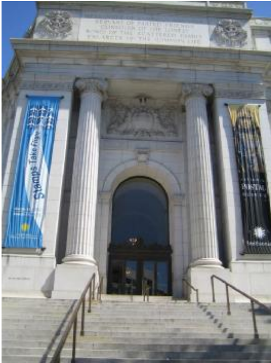
Main entrance of the National Postal Museum

Opened in 1993, the museum is part of the Smithsonian Institution. It is located on the lower level of the historic City Post Office Building, which served as the Washington, D.C., post office from 1914 - 1986. It is located on Capital Hill across the street from the Union Station train terminal and METRO stop.