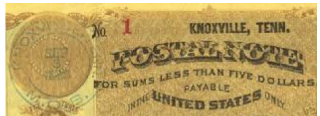
U.S. Postal Note, with serial number 1 from Knoxville. Size – 81 mm by 155 mm.

Wikipedia, http://en.wikipedia.org , the online encyclopedia describes postal notes as low denomination money orders with values up to $5. It furthermore indicates that low value notes post-marked on the first day of issue were created as souvenirs. This one was originally purchased in the amount of 2 cents, plus the 3 cent fee for the note.