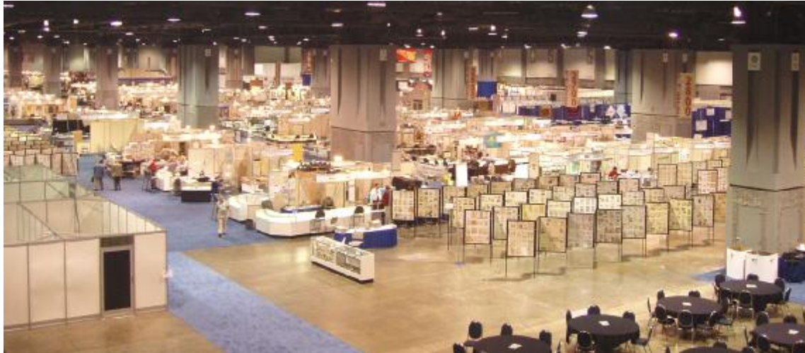
The show floor in the Washington Convention Center had hundreds of dealers and thousands of pages of exhibits.

Every ten years, the United States hosts a major international philatelic exhibition, and the 2016 show is already scheduled for New York city. Here are a few photos of KPS members at Washington 2006.