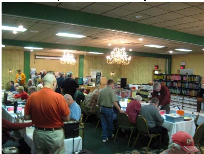
The dealer bourse was busy all day Saturday.

Here are a few photos from Jim Pettway's camera showing last month's successful Knoxpix 2008.