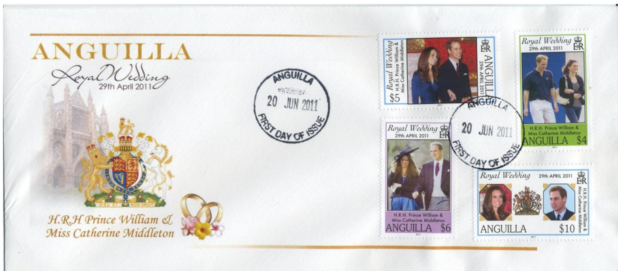
Official cachet first day cover of the 2011 Royal Wedding stamps of Anguilla

They had failed to submit a timely request for permission to use the Royal photograph and had to go with a generic cachet. All of the remaining envelopes had to be destroyed, and my plea to obtain the lone remaining cacheted envelope was denied, because everyone in the office would have known who gave it to me. I corresponded with a guy in Michigan who visited the Anguilla Post Office in the early 1980's and used to get access to errors and printer's waste. I guess I came 15 years too late for that. To date, Anguilla has issued 1182 stamps, most of which were prior to 2005, when 5-6 sets a year were the norm. Since that time new issues have been limited to one or two sets a year. I have found collecting the beautiful and high quality stamps of Anguilla to be challenging and exciting.