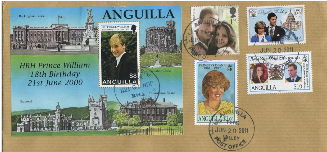
Commemorative cover created and mailed on the First Day of issue of royal wedding stamps by Rich Kaplan