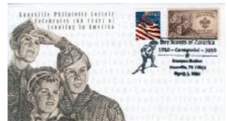
KnoxPex 2010 Cachet