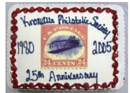
KPS 25 th Anniversary Cake