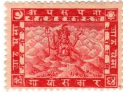
Eight pice red of the 1907 series

The Pashupati Era covered over 40 years, from 1907 to about 1950, when the printing of the Pashupati design stamps ceased and modern stamps were introduced. The Pashupati name is derived from the design on the stamps and postal stationery of the period. The central focus of these indicia is Sri Pashupati, a manifestation of Shiva Mahadeva, the patron God of Nepal. Because of this, the stamps are sometimes called the “Shiva” series. The image on the stamps is taken from a representation of the Pashupati on the lingam in the Sri Pashupatinath Temple near Kathmandu. The Pashupati name is also applied to the series of cancellations that paralleled the use of the postal issues.