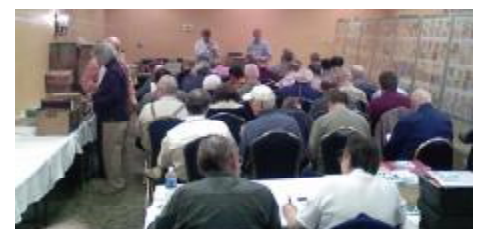
KnoxPex 2010 Auction