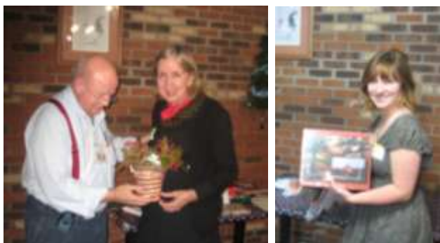
Many popular gifts were exchanged.

The Knoxville Philatelic Society meets at 7:00 pm on the 1 st and 5 th Tuesdays of each month at the Tennessee Valley Unitarian Universalist Church at 2931 Kingston Pike, Knoxville, TN 37919.