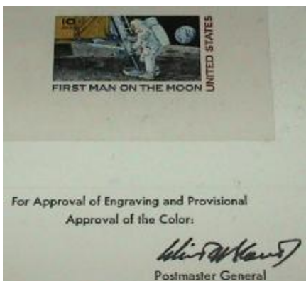
Figure 4. Approval of the Man on the Moon stamp.