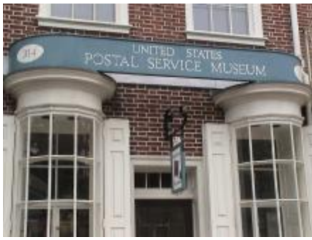
Figure 1. USPS Museum.