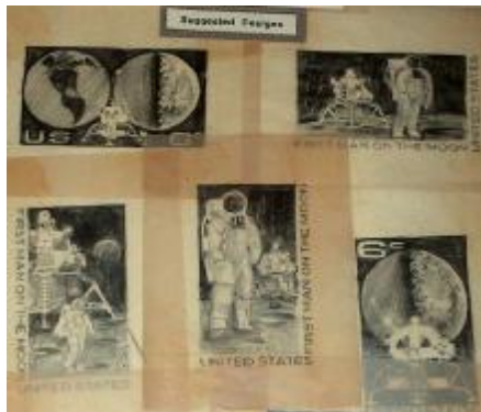
Figure 3. Suggested Designs for the Man on the Moon stamp.