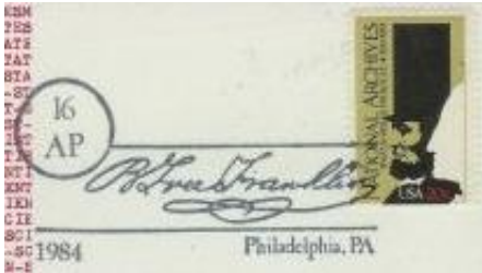
Figure 2. “B. Free Franklin” Postmark.