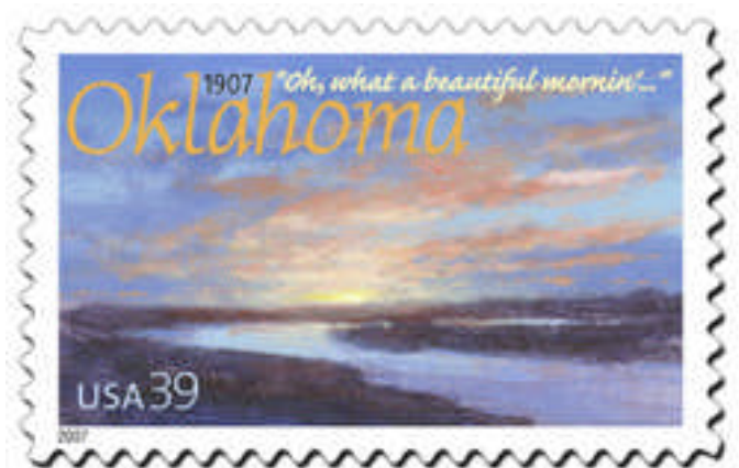
Reprinted from USPS Community Relation, Stamp News Release Number 06-050, October 25, 2006.

Oklahomans enjoy a thriving economy based largely on agriculture, service industries, and oil and gas. Tourism is also important, with visitors drawn to a wealth of natural wonders, historic sites and cultural offerings. These include the Wichita Mountains in the southwest; the Ouachita National Forest in the southeast; the Cherokee Heritage Center south of Tahlequah; Sequoyah's Home Site near Sallisaw; the Oklahoma History Center and the National Cowboy & Western Heritage Museum, both in Oklahoma City, and the Gilcrease Museum and Philbrook Museum of Art in Tulsa.