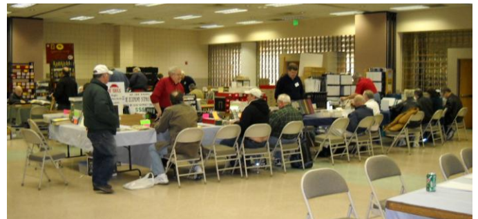
A view from ALAPEX in Birmingham in February.