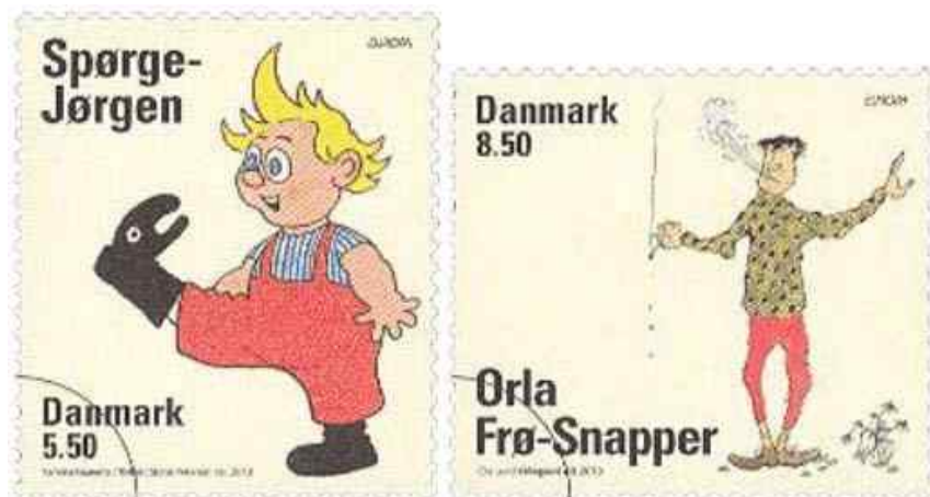
A new stamp to be issued in the Europa 2010 series by Denmark.