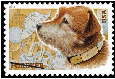
July 27 - Owney the Postal Dog