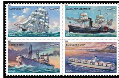
July 28 - U.S. Merchant Marine